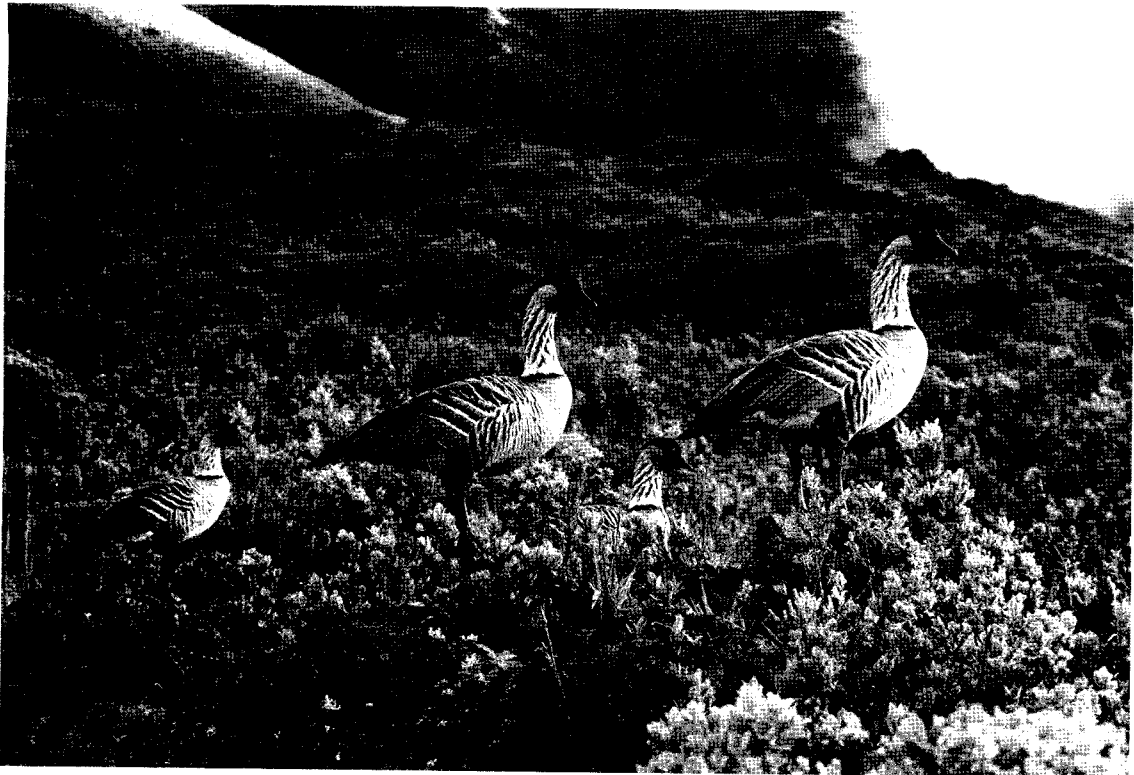
Figure 1. Four Hawaiian Geese, better known as Nene, in Haleakala Crater, Maui, where 200 British-reared birds were released in the 1960s. The Crater, which is 3 km \times 11 km, contains lush native vegetation as well as a cultivated grass pasture. The climate at this elevation (c. 2000–2500 m) can be severe, with heavy winds, rain and cold temperatures. Two of the British-reared geese were still alive and approaching 30 years of age during our study.

Branta leucopsis project (Owen & Black 1989). Data from multiple resightings for each bird were stored, including date, location, mate, number of young, flock size and body fatness. Additional files on nest success, predation and flock demography were prepared. After 25,000 records were amassed and first analyses were completed, the data base was prepared for installation with each collaborator in Hawaii. These data were used for calculating extinction probabilities for each subpopulation under various management scenarios, using the VORTEX programme (Black & Banko 1994). Using the SURGE capture–recapture model, we determined the mortality rates for Nene released in six sanctuaries (Black et al. 1993).