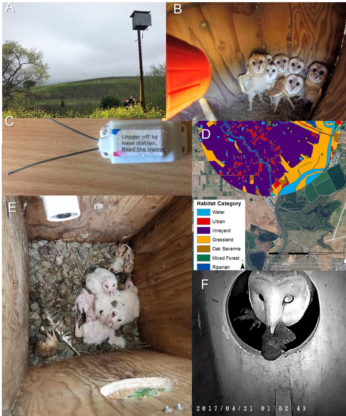
Figure 3. Images of methods currently used in Napa County to investigate three research questions on the capacity for barn owls to contribute to IPM in winegrape vineyards. Nest box occupancy can be efficiently monitored using a blue-tooth enabled video camera mounted on an extendable pole (A); which transmits images to the field worker's smart phone on the ground (B). New advances in GPS telemetry enable researchers to attach transmitters weighing as little as 13 g to barn owls (C), and data can be retrieved remotely or by re-capturing the bird, revealing detailed information about their movements and locations (D) useful in determining how often the owls are in vineyards. Inexpensive remote surveillance cameras can be mounted to the inside of nest boxes (E) and, when connected to a power source and video recorder, can document prey deliveries by adults to the nest box (F), which provides essential data for estimates of rodent removal from vineyards.